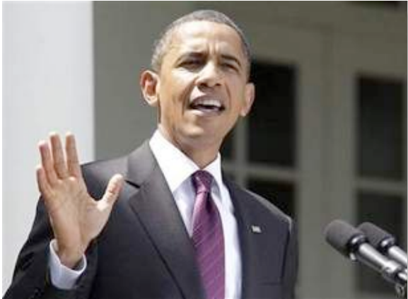
President Barack Obama in the Rose Garden at the White House.